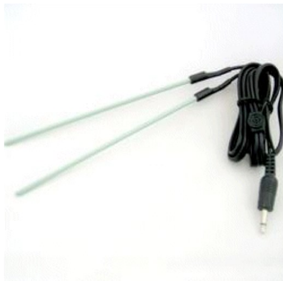
Protimeter Deep-Wall Probes

The Protimeter Mini and the Protimeter Surveymaster SM are two small hand units that can plug in long-pin, wall-type resistance pin probes.