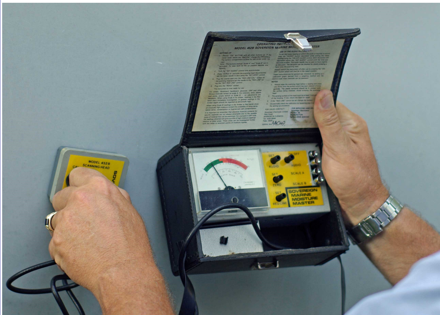
Sovereign Moisture Meter

In fact, you should always specify the make and model of the meter, and the scale used for the reading in your report. There is a large difference between the scales used on different meters (and on different scales on the same meter).