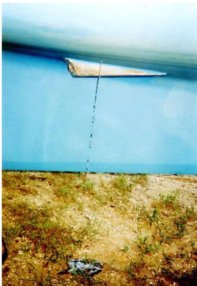
Water shooting out of the core of a 34-foot foam-core boat

hailed out and kept dry for several days or longer. The core will still be wet but the surface dry. Indeed, the surface could well dry to a 0.8% moisture content (not too bad). The moisture content will continue to increase as you drill or grind down into the hull. It's almost a straight-line increase, and could well be as high as 1.75% moisture content 0.1 inches in from the gelcoat surface.