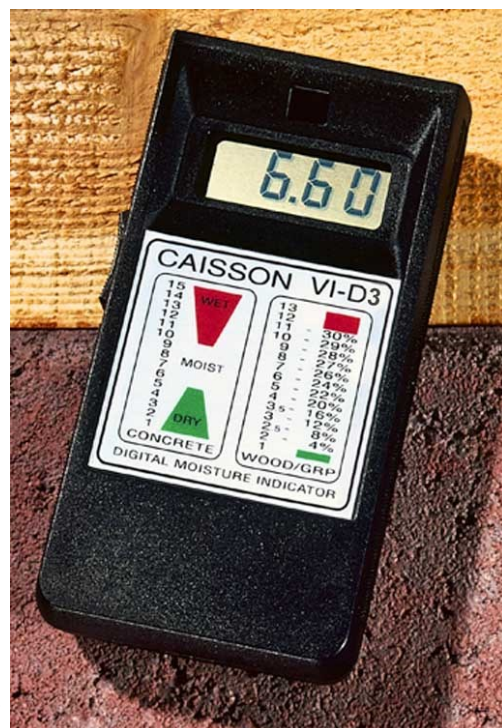
Novanex Caisson Moisture Meter

The "salts" we're referring to are not simple table salt (Sodium Chloride) found in sea water. Chemically, salts are a vast array of ionic compounds created during the total or partial neutralization of acids. Salts can also be created by