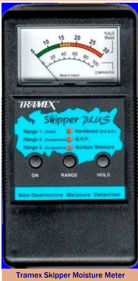
Tramex Skipper Moisture Meter

A foam-cored 34-footer (10.4 m) was brought in to one of my builders for repairs. Water had migrated remarkably efficiently through fastening holes and along improper open channels left by unfilled kerfs in the core. Nearly the entire hull shell—from keel to sheer—was flooded with water. Hauled out, water literally shot out of test holes we drilled in its bottom. One hole alone filled a 1-gallon (3.2 l) coffee can three-quarters full in just a few minutes.